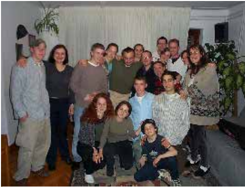
Our Home with U.S. Navy friends

whoever was listening (some were old provisioning contacts, some newly met friends).