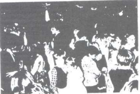
The children's disco dence held in our portant play is, before they even start dren learn so much through play."