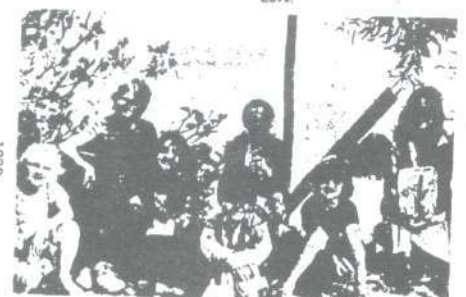
Our Kid Power group of Mene, Dic enjoying an excursion to the island