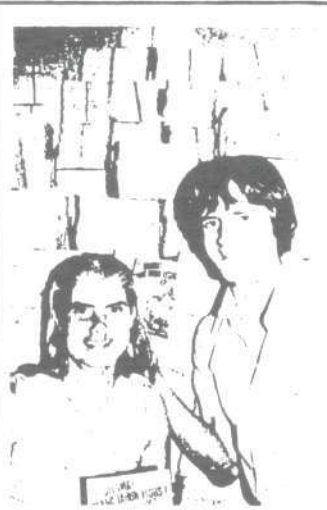
Here's Your Birthday Present Jesus! Word by the 1000's to win the last!

saved hardly before we left Jakarta! Around night time we arrived in Cirebon, halfway so decided to stop the night and head off in the morning. We went to one of the nicest hotels in town and they gave us two beautiful rooms and breakfast the next day for under 1/2 price! That morning we hit the streets with God's Word. Markets, schools & shops and got out over 8,000 pieces of literature before heading off again around 12:00. That evening we arrived in Semarang. There we set up at the home of sweet Josh & Suzzie who warmly welcomed us and took us in for the next 5 days. GBT. In those 5 days we were