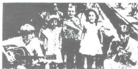
-KID-POWER!! - Sharing Gods love - in song!