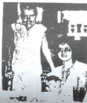
Snack-time to break a long drive!

So we were ready to go, Levi & Casandra & 4 kids with Tini our Indonesian maid and both of us making 5 adults & 4 kids. One of the first things that happened was Tini our sweet maid got