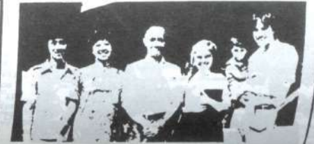
The sweet family that helped us prepare the truck trip!

Our Christmas shows were also a great success with hundreds of souls receiving the Lord from the shows the kids put on! They really won everyone's hearts! GBT!