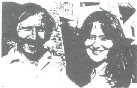
Chronicles & wife Patience during their meeting with Faithy!

THE MWM VIDEOS WERE SUCH A BREATHER OF FRESH AIR! —Convicting, loving, inspir-