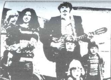
An American & his family have been travelling many years thru' Europe to bring the Gospel to the people. They are presently camping locally in their caravan.