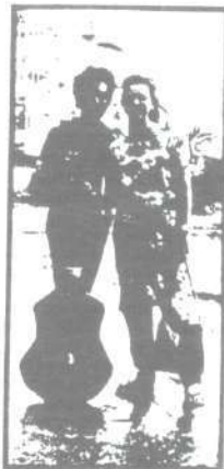
Indian nationals & MWM "roving minstrels" who travel to out-of-the-way towns to meet & inspire MWM Club members in India.

BY THE TIME WE'D BEEN ON THE AIR FOR A YEAR or so, we had a regular Club membership of nearly 1000!