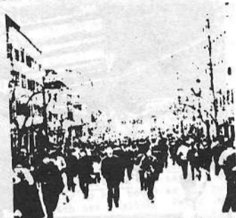
Chungking - Population - 6 million!

ing in Bibles & literature as well as through the mails.