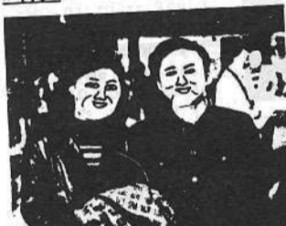
Our musician friend & wife

11)ON CHRISTMAS DAY HE BROUGHT HIS WIFE OVER, who was not a Christian yet. So being Christmas day it was a good opportunity to explain Christmas & Jesus to her. After witnessing to her we all held hands & she asked Jesus into her heart! PTL! Everyone was so happy!