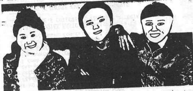
Three precious Chinese young people who gladly prayed to receive Jesus into their hearts. Central China.

6)WE THOUGHT OUR TRAIN RIDE FROM CANTON-KUNING-CHENGDU had the most beautiful scenery we had ever seen. Thank the Lord for His beautiful creation.