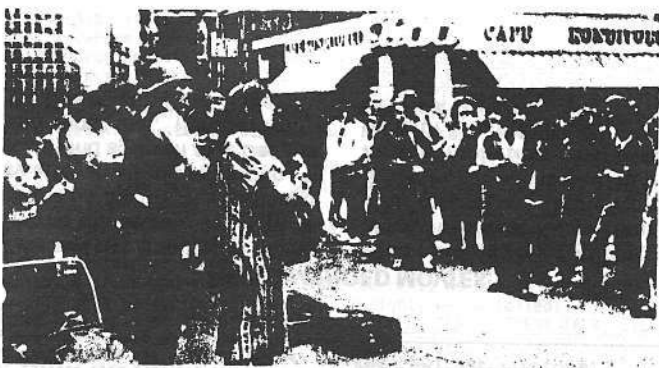
They draw quite a crowd & have received many good responses from spectators!

SINGING: "In this place there is so much peace & joy gathered! People stay here & look at you & all thoughts of war & strife seem to have vanished... An example of how life could be lived is spreading here... It is so beautiful to sit here & feel well! You radiate so much happiness, that all the children of this world should have been gathered around you."