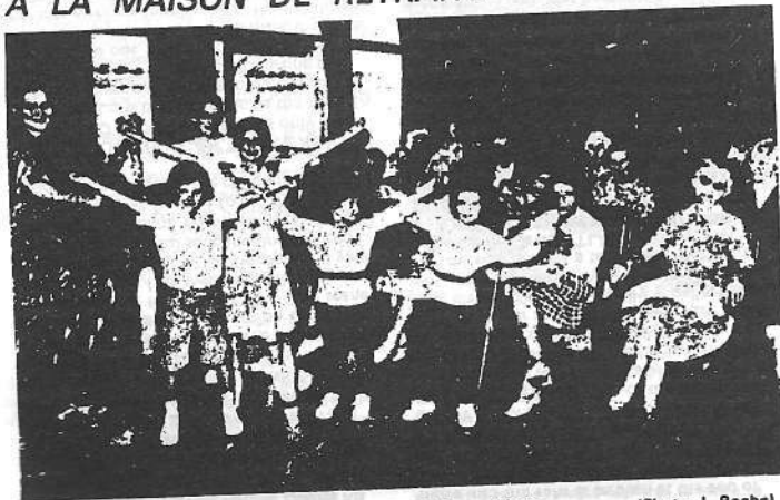
De jeunes artistes tout heureux de faire montre de leur talent.

WE WERE THRILLED WITH THE RESULTS of the 7-8 shows that first Christmas during their vacation. Before that, it seemed like an impossible task to get something together with the children, but having a deadline is what we really needed. TYJ! We had done some restaurant singing with them, but it was the first time that they performed as a group & the beginning of what we later called "Love-light" or "La Lumière d'Amour!"