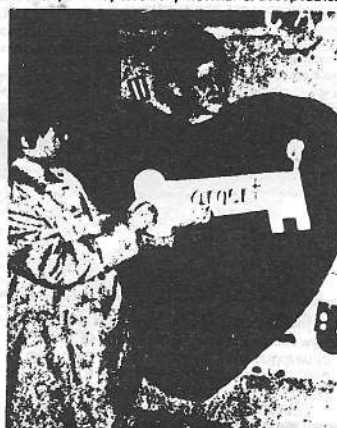
Is money the answer to all of my problems & the key to my heart?

OUR MOST ENCOURAGING & SUCCESSFUL OUTREACH WITH THE CHILDREN took place this summer. Early in the spring, we met a woman who suggested that we present our little show to a group of 13 retirement homes which are very well funded. She insisted that we ask to be paid as they could afford it as well as to ask for lodging & meals which, she also explained, was very normal & acceptable.