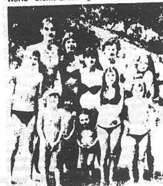
We had a beautifully refreshing & inspiring time alongside a beautiful mountain stream. PTL!

WE ADDED TO THAT SHOW THE SKIT OF THE "ROCK IN THE ROAD" which we adapted literally from the MWM version making that the first skit in the "Change the World" theme & adding the following ending: