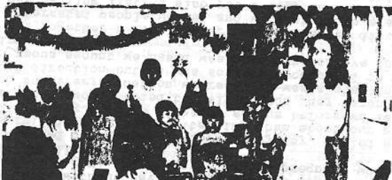
A Christmas play done by the neighbourhood children for their relatives and friends.