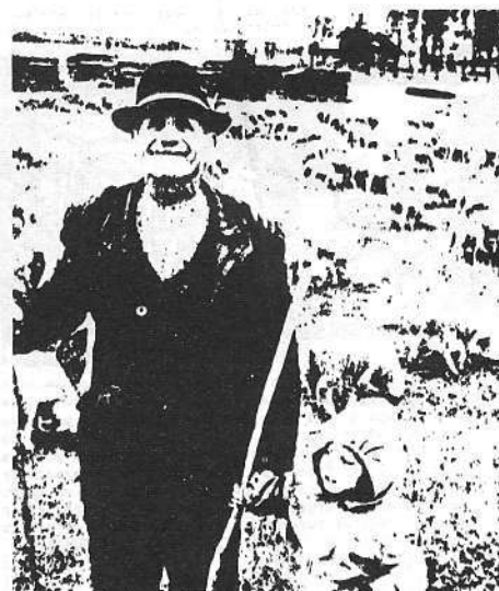
Many are the Russian sheep of David.