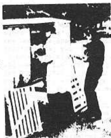
A bread wagon in a village along the way to Kiev.

WE WATCHED TV AT TWO DIFFERENT TIMES, the first in Kiev where when we went to swim at the Dnepr River we