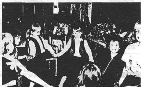
"Singing 'You Gotta Be A Ruby' to old folks!"