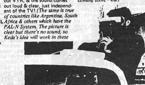
Ho on location in the Orient! See it via video, coming soon!

countries as well. More details coming soon. --Ed.)