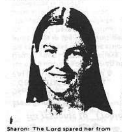
Sharon: The Lord spared her from cancer. Please continue to pray for her complete recovery!