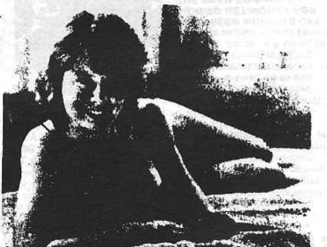
Sweet Robln, caravanning in the U.S.A.