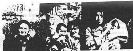
Athens newspaper photo shows survivors of the quake seeking refuge in the streets. "These are the ones that we need to be praying about & ...caring for & striving to help... whom we need to reach with the Gospel & the Love of Christ & the Message of Salvation..." (No. 959:112:2)

WHAT A CONFIRMATION OF THE URGENCIES OF THE TIMES & the need to be prepared now, found in the Letters! Another tremor came at 4:30 a.m. & another strong one at 7