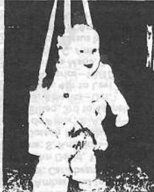
4-mo.-old Rebecca Sunshine in her "jolly jumper" in the trailer.

BEING INSIDE MORE, now that it's colder & dark earlier, we're finding it better to park where there's "things to do", like exploring stores after litnessing, or shopping with Mom & Dad. With 9 kids this is usually a hit! Ha! Actually, we haven't attempted all 9 yet but usually split up into two smaller groups of 4 & 5 each to make things easier! Ha, PTL, with God nothing is impossible! (Can't someone help?—D.)