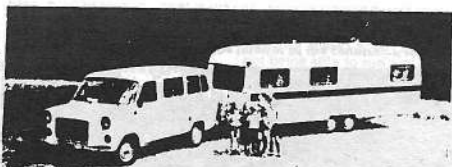
Fiona & her 6 children mountin' the mountain with their mobile home!

"YOU CAN ADAPT YOUR TAPE RECORDER TO PLUG INTO YOUR CAR BATTERY using a transformer. Also with laundry being a problem while