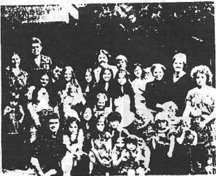
Family get-together in Spain! Sorry, no names given. Recognise anyone?