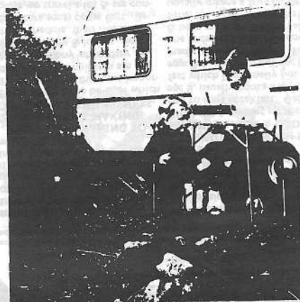
Mommy does reports while the kids enjoy God's great outdoors!

school brochures & materials, GBHI! Around 1 p.m. the children have a little rest, either in the van or caravan depending on whether we are travelling. In the afternoons the children fit into what is going on, whether it be visiting or witnessing. This is our basic schedule, altho' it varies or changes according to