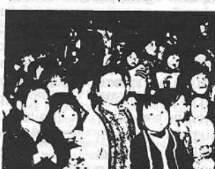
Expectant faces of little children during one of the Ho children's benefit shows in Hong Kong.

BEGINNING IN THIS RURAL AREA OF CHINA with the more simple people will be a