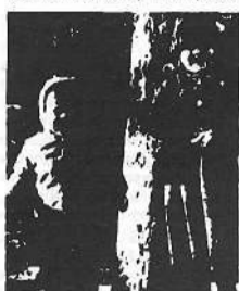
Ester-3½ & Michelangelo-1½ play with daddy in the park while Mommy makes lunch in the caravan in the background.

WHEN IN THE EAST WAS TO IMPROVISE, & it's really amazing what can be done when you have to do "without".—When you want to! It's an encouragement for the future that once we know what is needed we can very quickly make things up—flash cards, wooden blocks & books & even homemade dolls, as in the East we couldn't buy 'em. THE LORD NEVER FAILED IN ANY WAY. Back in Europe we are making use of the good system educational toys etc., but again the Letters are something that we can't do without & turn to another source, so for us they are the priority.—Also the children's material by Family Care.