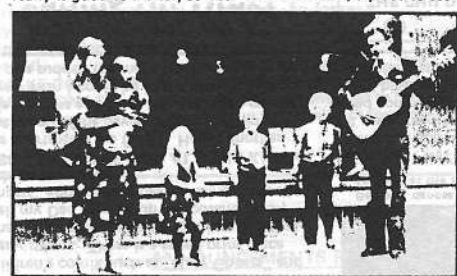
Singing their way across Europe! What a way to witness as a family!

ON THE 7TH DAY THE LORD SUPPLIED OUR NEED—part of a summer house owned by an architect