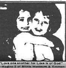
"Love one another for Love is of God" —Blessed of God Mother & Father