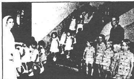
The first day of school!—"They were very happy to accept them and were even willing to place them in whatever grades we suggested..."