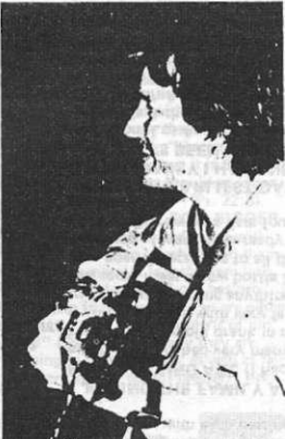
Watchman worms up to record in Mexico City!

around with my knowledge of Spanish etc.