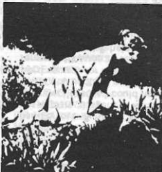
Classical painting of "Psyche"

5. THERE ARE MANY WAYS TO VERY GRACEFULLY & ARTFULLY HIDE SEX from sensitive Systemites without having to conceal the beauty of the completely nude form. This was also often accomplished by hav-