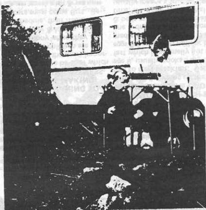
Mommy does reports while the kids enjoy God's great outdoors!

school brochures & materials, GBH! Around 1 p.m. the children have a little rest, either in the van or caravan depending on whether we are travelling. In the afternoons the children fit into what is going on, whether it be visiting or witnessing. This is our basic schedule, altho' it varies or changes according to