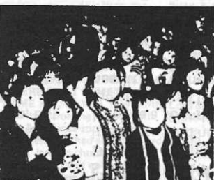
Expectant faces of little children during one of the Ho children's benefit shows in Hong Kong.