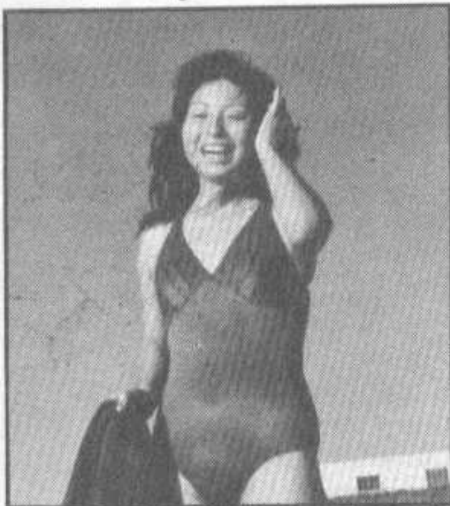
Psalms—co-KQS with Keda of the Pacific!