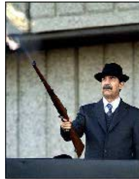
SADDAM FIRING RIFLE DURING PARADE. "ALL THOSE WHO TAKE THE SWORD SHALL PERISH BY THE SWORD" (MAT.26:52).

But God is the great judge, and those who do not know Me will stand before His great white throne to receive judgment from Him in the era to come. This is where Saddam and many others will receive true judgment, judgment which men cannot comprehend or enact, for they cannot see or fully discern the heart. Men often judge surface judgment, for they see only a few sides to a situation—even you, My beloved. For My thoughts are not always your thoughts, nor are your ways always My ways, since you are still so much a part of the physical world. To help you understand these matters, I will explain more of the way of kings and their manner of judgment to you, for there are many facets.