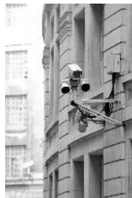
DIGITAL SURVEILLANCE CAMERA MONITORING CITY STREET

identification tags to monitor the locations of people as well as inventory. In January, Gillette began attaching such