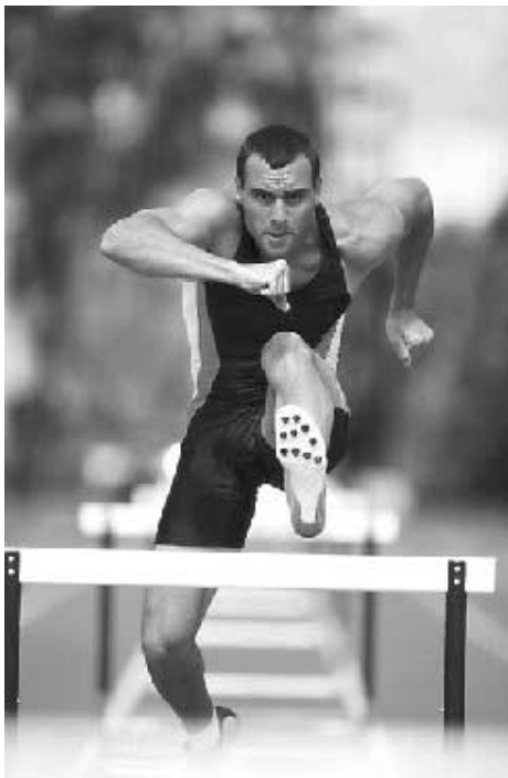
LEAPING THE HURDLES TOWARD BETTER SELF-DISCIPLINE

FROM THE PILLARS OF CHRISTIAN CHARACTER BY JOHN MACARTHUR