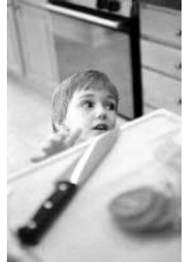
KIDS IN THE KITCHEN CAN LEAD TO ACCIDENTS AND INJURY

Kids and caution in the kitchen. ( HealthScout-News ) Each year in the U.S., about 24,000 children aged 14 and under are treated in hospital emergency rooms for scald burns. Some safety tips: