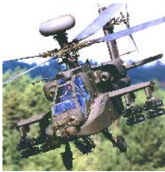
APACHE LONGBOW HELICOPTER: $22 MILLION EACH

(Dad:) It's incredible that the governments of the world are on track to invest nearly a trillion dollars a year in killing people. You can't tell me that that amount