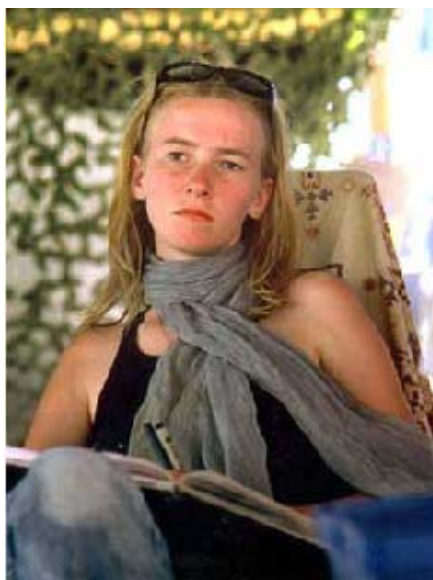
RACHEL CORRIE, 23-YEAR-OLD AMERICAN WHO WAS RUN OVER BY AN ISRAELI BULLDOZER

last few months they've shot or killed at least three foreign nationals in the West Bank or Gaza who were simply trying to help or protect the Palestinians.