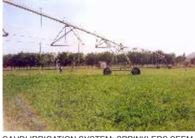
SAUDI IRRIGATION SYSTEM: SPRINKLERS SEEM TO SPRAY EVERYWHERE.

(Dad:) One day the Saudis will reap what they have sown. The rich Saudi rulers have practiced extreme harshness and intolerance toward their own people for the smallest offense, or have even chopped off limbs or heads for larger offenses. At the same time, these rulers have done the same things they've punished others for, and worse, whether in secret at home or abroad where their people couldn't see them.