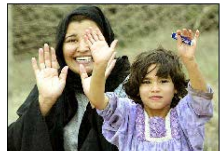
SOME IRAQIS GREETED U.S. FORCES WITH JOY—IN THE BEGINNING.