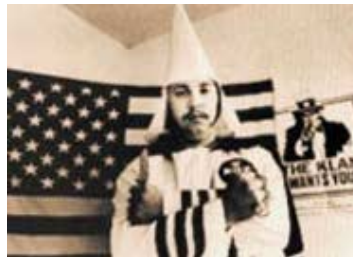
CLARY AS GRAND WIZARD OF THE KKK