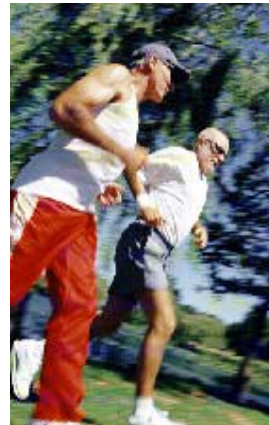
REGULAR EXERCISE IS VITAL.