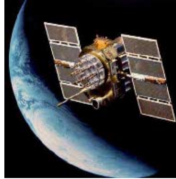
GPS SATELLITE: THE SKY DOES HAVE EYES.

U.S. buys Latin American citizen data. (Jim Krane, Associated Press ) Over the past 18 months, the U.S. government has bought access to data on hundreds of millions of residents of 10 Latin American countries—apparently without their consent or knowledge—allowing myriad federal agencies to track foreigners entering and living in the United States. A suburban Atlanta company, ChoicePoint, collects the information abroad and sells it to U.S. government officials in three dozen agencies.