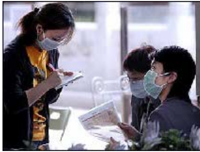
HONG KONG WAITRESS AND CUSTOMERS IN FACE MASKS

I'll use the U.S. for an example, since it's one that many of you are familiar with. Though we have condemned the U.S. for its wars, materialism, and many sins against God and others, the U.S. and many of its citizens also stand up for individual rights and religious freedom around the world, among other things.