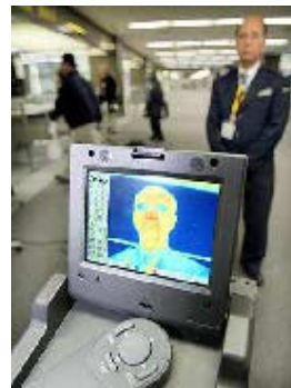
THERMAL SCANNER USED TO DETECT SARS AT AIRPORT. PASSENGERS RUNNING TEMPERATURES ARE CHECKED OR QUARANTINED.

Shaking hands with friends at work. Touching an elevator button. Touching a doorknob. Holding on to the railing when riding an escalator. Pushing open a shop door at the shopping mall. Just