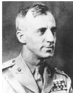
MARINE MAJOR GENERAL SMEDLEY BUTLER

“War is a racket. It always has been. It is possibly the oldest, easily the most profitable, surely the most vicious. It is the only one international in its scope. It is the only one in which the profits are reckoned in dollars and the losses in lives. A racket is best described, I believe, as something that is not what it seems to the majority of the people. Only a small ‘inside’ group knows what it is about. It is conducted for the benefit of the very few, at the expense of the very many. Out of war a few people make huge fortunes.”— Marine Major General Smedley Darlington Butler , one of only two Marines in history to have received two Medals of Honor, writing in 1933.