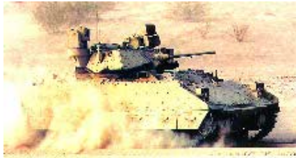
BRADLEY FIGHTING VEHICLE: MORE THAN $1.2 MILLION EACH

“We have a bloated, corrupt and unaccountable military industrial congressional system that thrives on a policy of perpetual war for perpetual peace.”— David Theroux , president of The Independent Institute, a nonpartisan think tank.