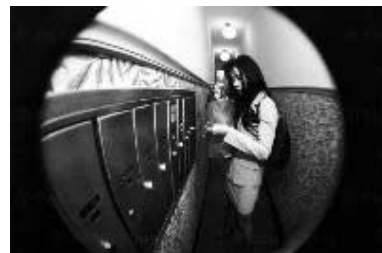
SURVEILLANCE PHOTO FROM APARTMENT LOBBY