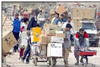
IRAQI LOOTERS CART OFF THE CONTENTS OF A WAREHOUSE.

Of course, the U.S. doesn't generally overthrow its allies, no matter how despotic or demonic they are. And it's also finding out that democracy in that region isn't all it's cracked up to be. Turkey is a democracy, and it voted not to let U.S. forces in to attack Iraq from its territory! And if the U.S. were to impose democracy in Saudi Arabia, many Saudis might vote for Osama bin Laden rather than their rich ruling family with its hundreds of profligate princes! And for that matter, what will the U.S. do if a new democratic Iraq