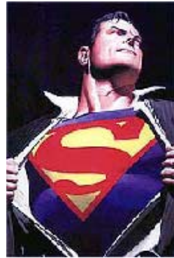
BRITISH STUDENTS CONFUSE JESUS WITH SUPERMAN.

British pupils ignorant of Christianity. ( Electronic Telegraph ) Almost half of Britain's 12-year-olds are so ignorant of basic Christian teaching that they