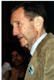
FORMER ATTORNEY GENERAL RAMSEY CLARK

The U.S. has been planning to attack Iraq and seize it for a long time. Former Attorney General Ramsey Clark documented it meticulously in his book, The Fire This Time , detailing U.S. plans from long before the first Gulf War in 1991!* And for that matter, the first Gulf War never really ended—the U.S. has been patrolling parts of Iraqi territory and bombing various military