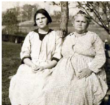
CARRIE BUCK AND HER MOTHER EMMA IN 1924

(Dad:) Yes, scientists can certainly be deceived and misguided and do a lot of damage. Look at Darwin, Freud and others, who've had a terrible effect on the world, one that has continued long after their deaths.