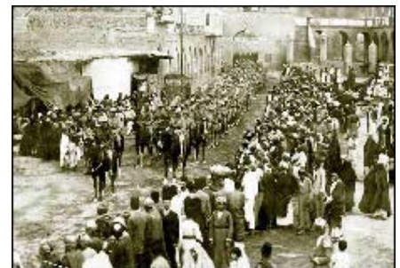
BRITISH FORCES ENTERING BAGHDAD IN 1917. "WE COME NOT AS CONQUERORS BUT AS LIBERATORS."

In 1917 the British won Iraq from the Ottoman Empire, the Turks, and British forces marched into Baghdad, proclaiming, "We come not as conquerors but as liberators." There was dancing and shouting and celebrations in the streets at first, but within a few years the Iraqis and the Kurds were engaged in all-out guerrilla warfare against the British, and the British were conducting horrific bombing raids in return. They even used gas shells, what people now call "weapons of mass destruction."