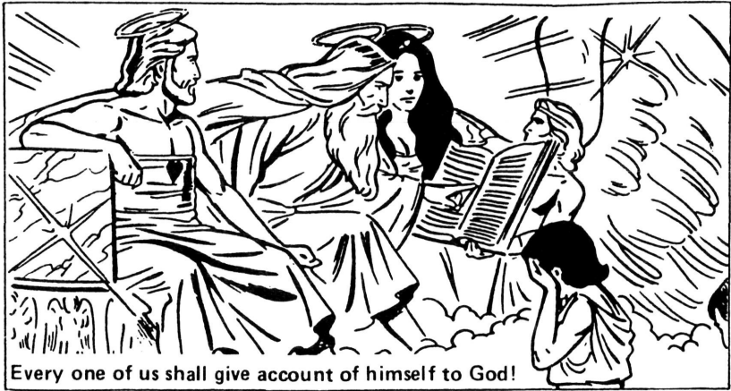
Every one of us shall give account of himself to God!

ultimately responsible for our problems, whoever they were caused by or whatever they are, whether we did it ourselves or whether somebody did it to us. We are responsible. Rom.14:12—"Every one of us shall give account of himself to God!" That's a very good Scripture on this subject for teens to know!