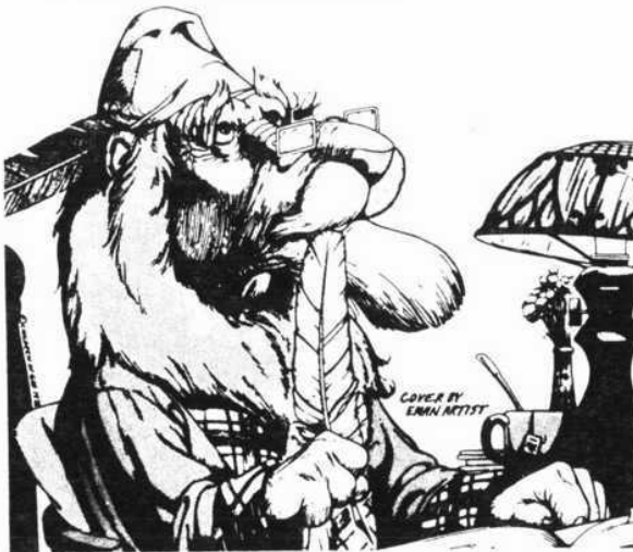
DAD'S MAIL MINISTRY