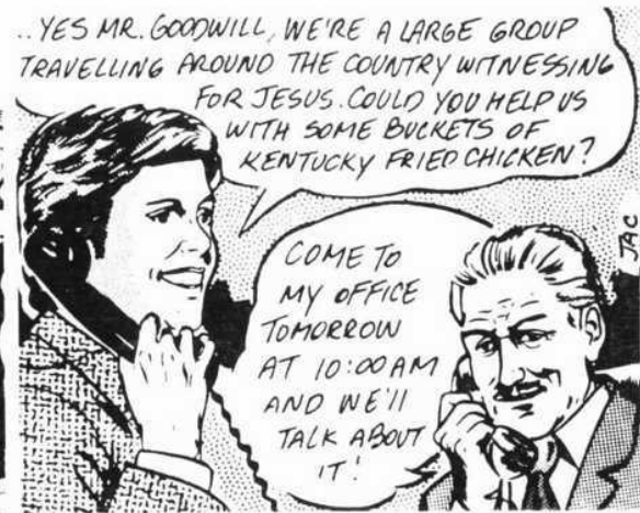
PROVISIONING ON THE ROAD